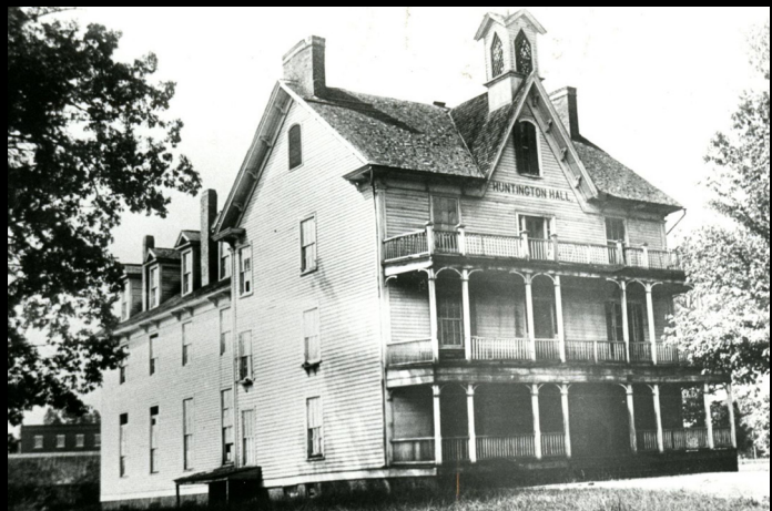
Huntington Hall was the first building used on the campus of Livingstone College. This building was used as a dormitory for college students until it burned down in 1918.

Kellogg, Robert. “Livingstone’s Origin” [Salisbury, NC]. Salisbury Post, nd, pp. 3E-4E.