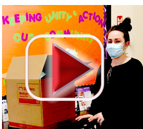
Watch the highlights of our 12-day Holiday Challenge.